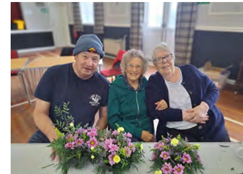
Flower Arranging at Danby Cuppa and Catch Up