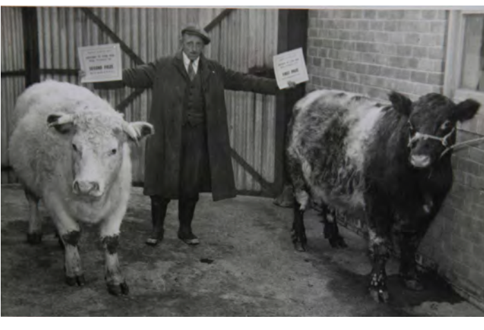
These two photos of Egton Show were taken a good while before Joyce's time! The photo on the right are thought to be first and second prize at Egton Show. Does anyone recognise this man?