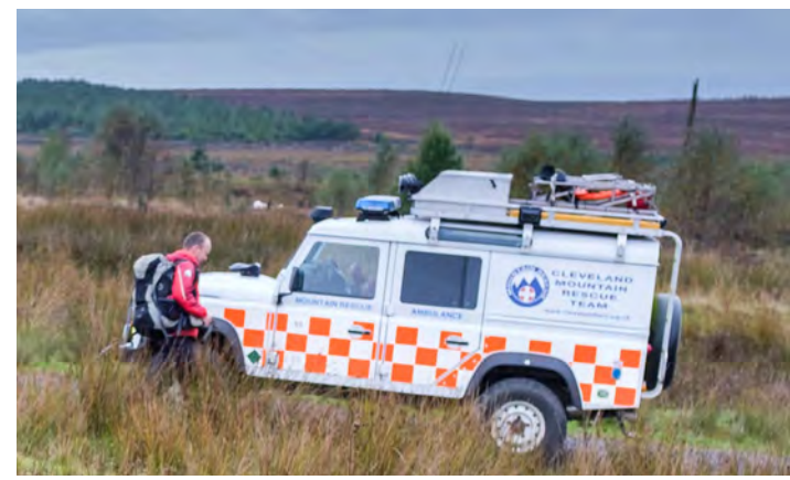
The Mountain Rescue Ambulance

To provide the service we do, we have to keep our expertise and skills current and this takes a lot of continued training. Our core training takes place every Wednesday evening and on five full weekends a year. Additional to this, we have specialist training in key areas of our operations. This includes technical rope rescue (dangling off cliffs), water and flood rescue (jumping in rivers and lakes), response driving (blue light driving), helicopters (being winched in and out) and, most importantly, medical training. Medically, the team is very highly trained and I'm not just saying that because I am the Medical Officer. Half of our