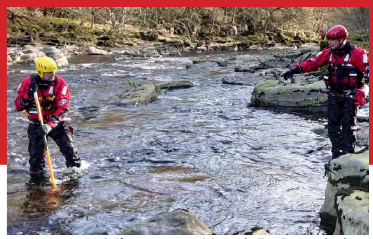
Swiftwater rescue training at the Tees Barrage, Stockton

All the areas of expertise we provide require the latest specialist equipment, so fundraising is a fundamental part of our continued existence. On average, it costs around £42,000 to remain operational annually. This includes buying sticky plasters (20p each) to kitting out an individual team member to be a Swift Water and Flood Rescue Technician (£1,200+). We don't receive any central Government money so all our funds have to be raised by generous donations from the public, grants applications for specific projects and occasional sponsorship from companies. All the funds raised stay within our team and are used to keep our three frontline vehicles and other