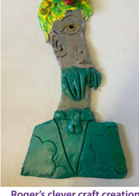
Roger's clever craft creation