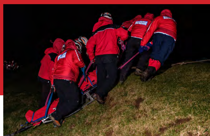
A successful rescue

equipment operational. We currently have two identical frontline Land Rovers and the third vehicle which is like a transit van that we use as a control vehicle during searches and a base when we provide medical cover at a variety of events. We have been very fortunate in the past few years that Mercedes Sytner, based in Stockton, has loaned us one of their 4x4 cars to use as a support vehicle. We also have a trailer to carry our water rescue rafts and equipment. All of this is stored at our team base just outside Great Ayton.