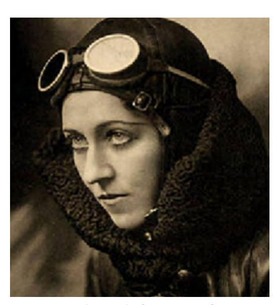
Amy Johnson - the first woman to fly solo from England to Australia in 1930