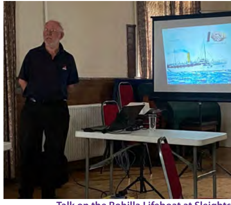
Talk on the Rohilla Lifeboat at Sleights Cuppa and Catch Up