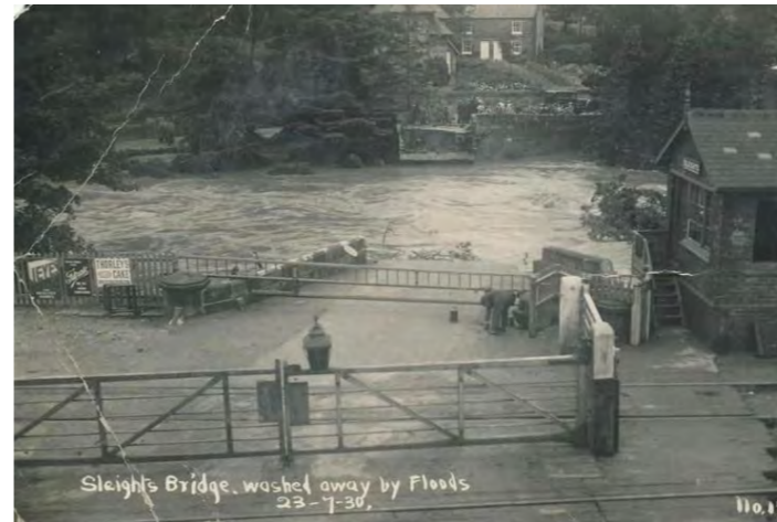
In 1930 the bridge was washed away in a flood - in July!

The whalebones dating from between the two World Wars graced the entrance to a field until 1970, when it became the village car park. Almost immediately opposite the car park is a branch of Bothams, the famous Whitby Baker's. Elizabeth Botham began her business as a widow in 1869 selling from a pie cart. Later she set up in Skinner Street, Whitby where the company's main shop and restaurant is. She also ran a beer house called The Hole in the Wall in 1890, which by 1903 she had given up.